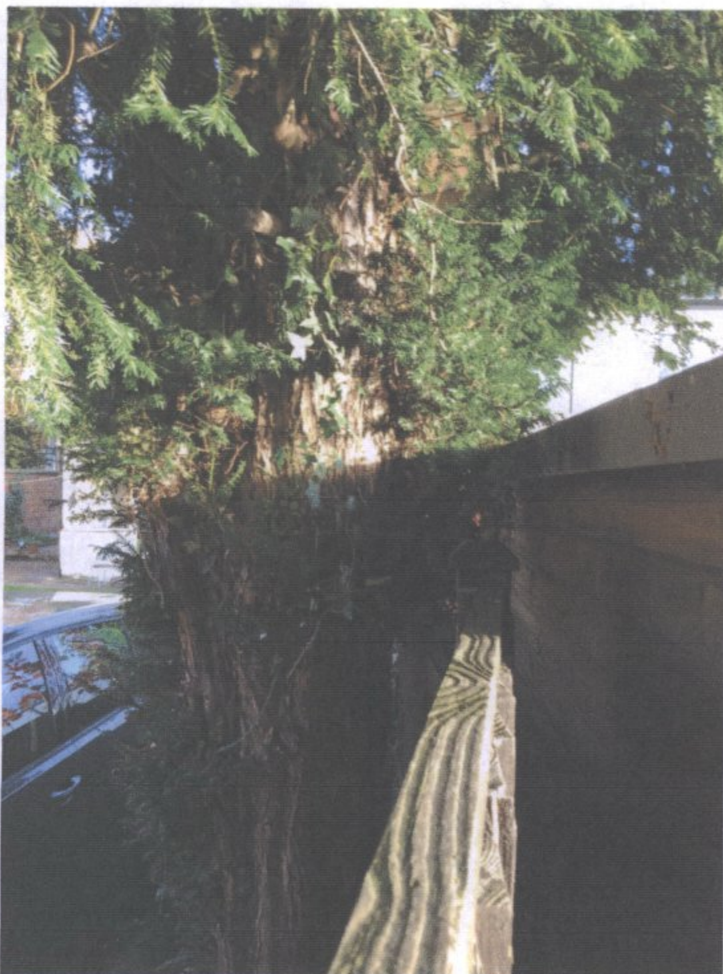
Photo 3: View from rear showing trunk forcing fence paneling out of line.