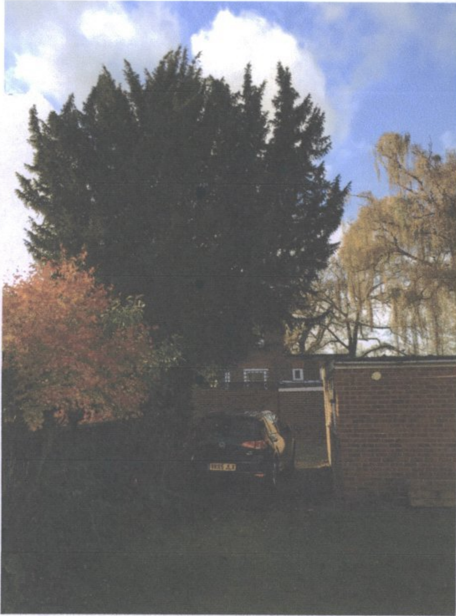
Photo 1: position of tree in the west, resulting in shading during summer. It can be seen that the tree is outgrowing the space available.